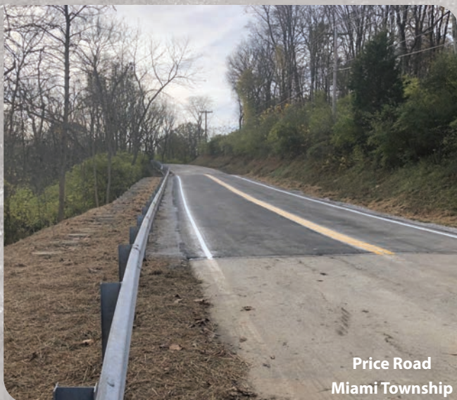
Price Road Miami Township

Beechwood Road CC8-9 Union Township Project Est.: $28,867