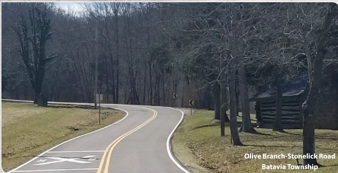
Olive Branch-Stonelick Road Batavia Township