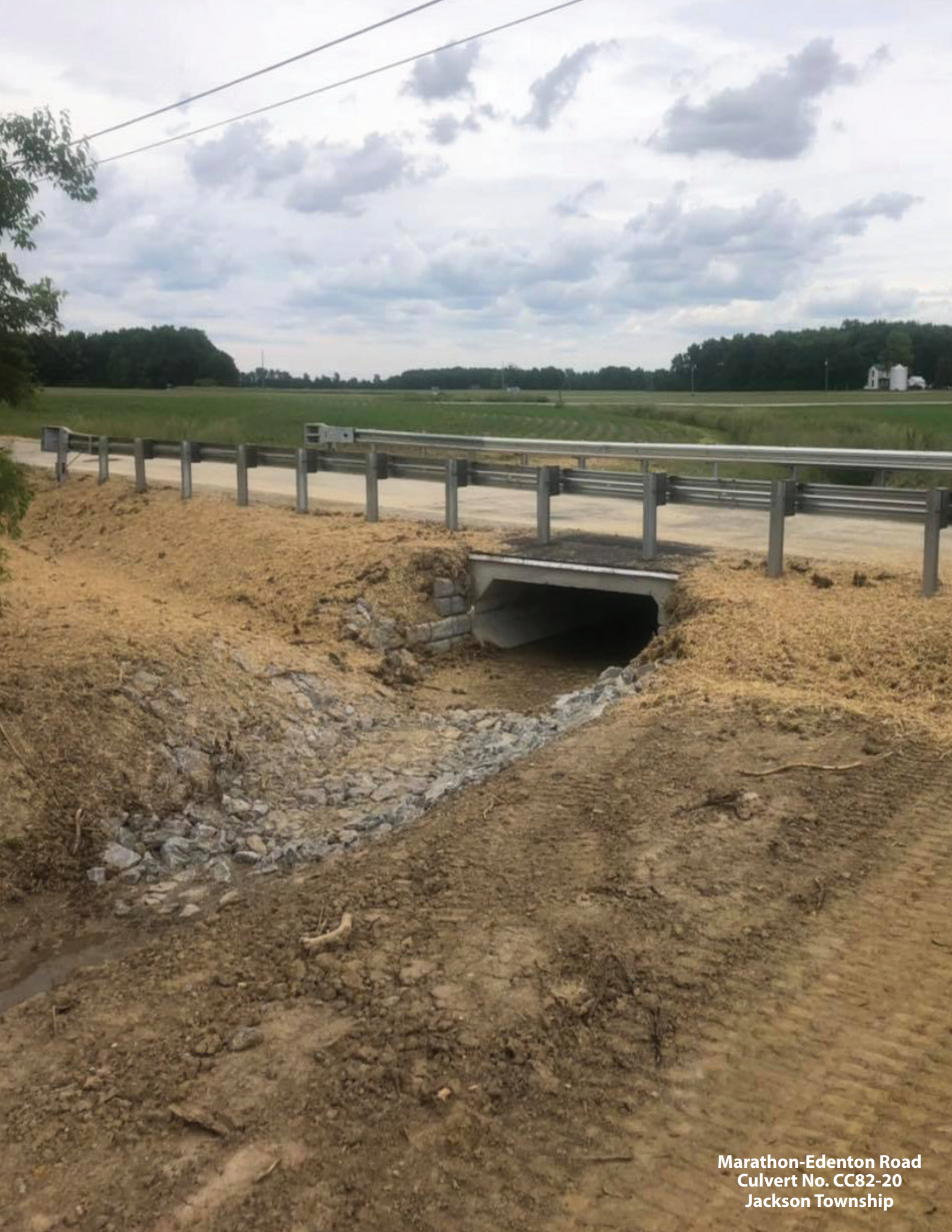
Marathon-Edenton Road Culvert No. CC82-20 Jackson Township