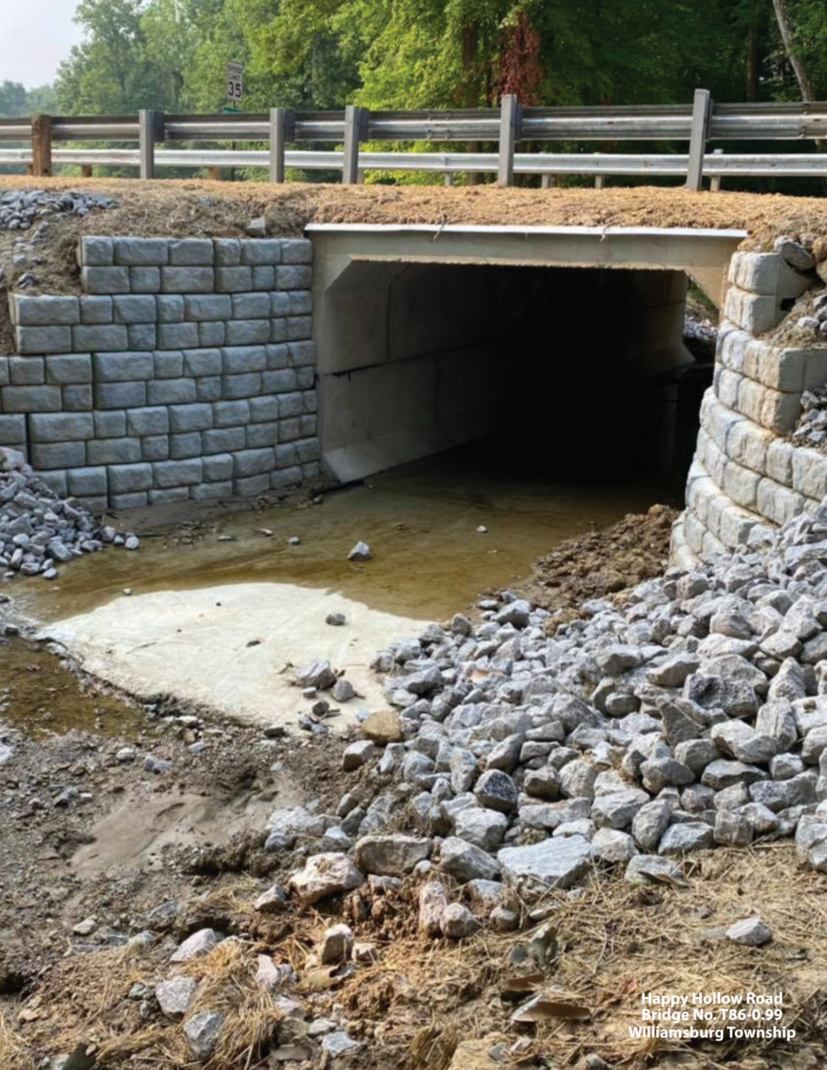
Happy Hollow Road Bridge No. T86-0.99 Williamsburg Township